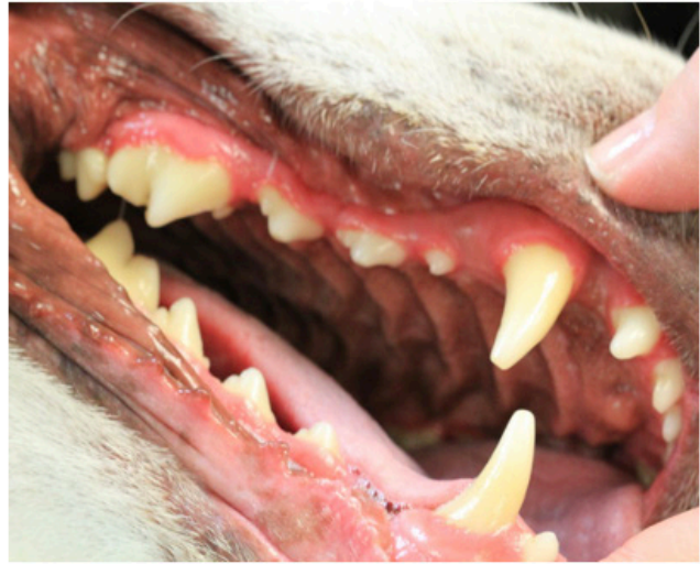
Molecular Iodine Treated

Plaque visualized with disclosing solution. Representative data at Day 28 of study