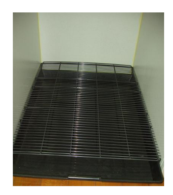
Figure F Figure G Optional Floor Grate and Pan Installation

Place the Floor Grate in the cage. Slide the ABS Plastic Pan underneath the grate. See Figure G.