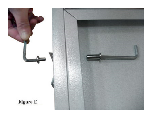
Hex Head Fastener installation

Optional Step: Open the cage door and lift it off of the hinges. Using two long screws attach the Door Extension Bar to the bottom of the door as shown in Figure F. Reinstall the door. Note: Skip this step if you are using the floor grate and pan.